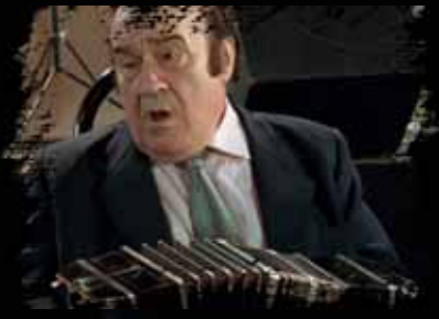
JOSÉ LIBERTELLA: The film shows one of the last life-appearances of the legendary bandoneonist who died in 2004 in Paris

for "12 Tangos" Luis Borda assembled an all-star- orchestra of argentine tango